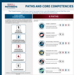
Paths & Core Competencies

To begin, you'll complete an online assessment designed to help you choose the path that best aligns with your goals and interests. From there, you'll have the option to explore these six available paths: